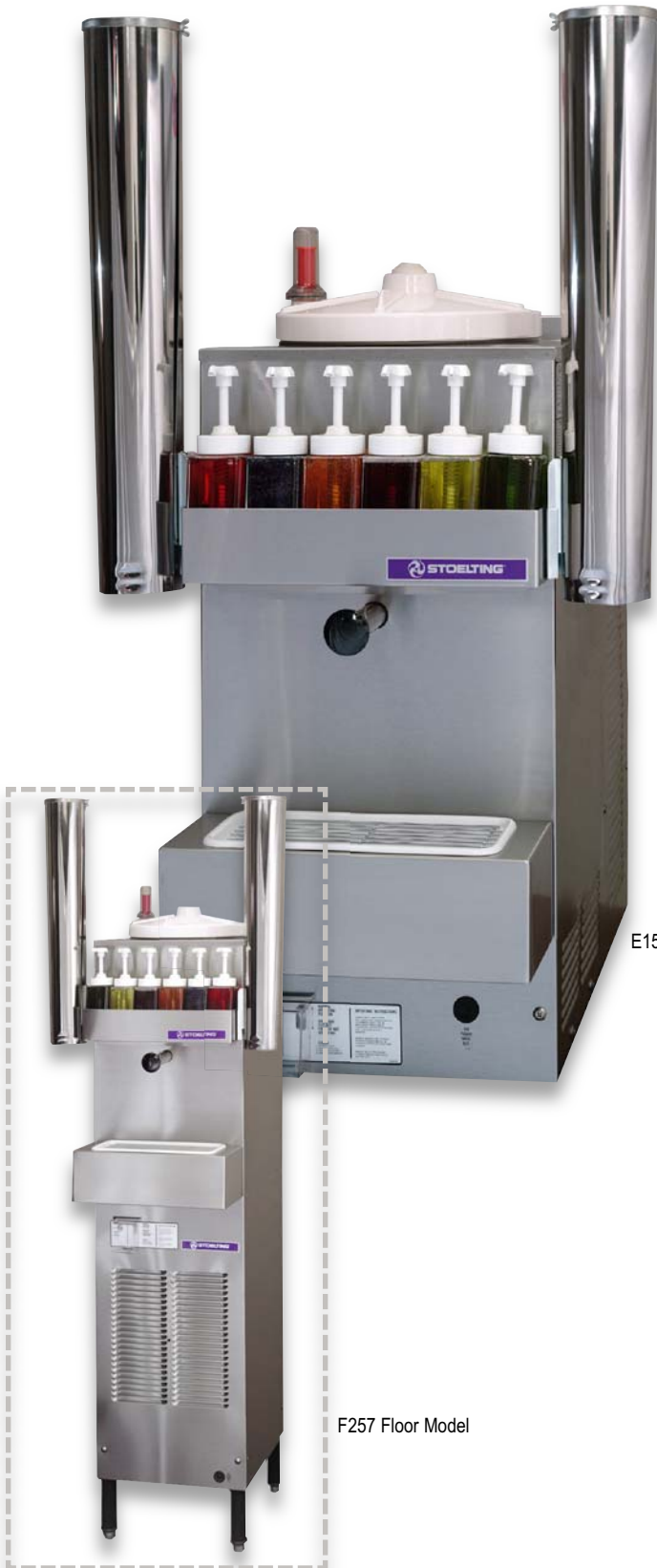
E157 Counter Model